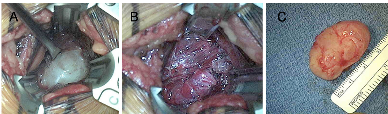
Fig. 2. Intraoperative photographs showing (A) the exposed L3 tumor, (B) status post resection, and (C) the resected tumor. (This figure is available in colour at www.sciencedirect.com .)

A 26-year-old male with a past medical history of neurofibromatosis type 2 presented with a history of progressive back pain with radiation down the left leg. His preoperative VAS score reported by the patient was 8/10. On examination, the patient had decreased sensation in the left L3 dermatome and 3/5 weakness of left knee extension. MRI revealed a large 3.4 cm by 2.6 cm nerve sheath tumor growing through the left neural foramen and extending into the psoas muscle at the L3/4 level. The patient underwent a MIS lateral extracavitary approach and resection of the tumor (Fig. 2). Total operative time was 75 min and the estimated blood loss was 100 mL. At the 3-month follow-up, the patient had