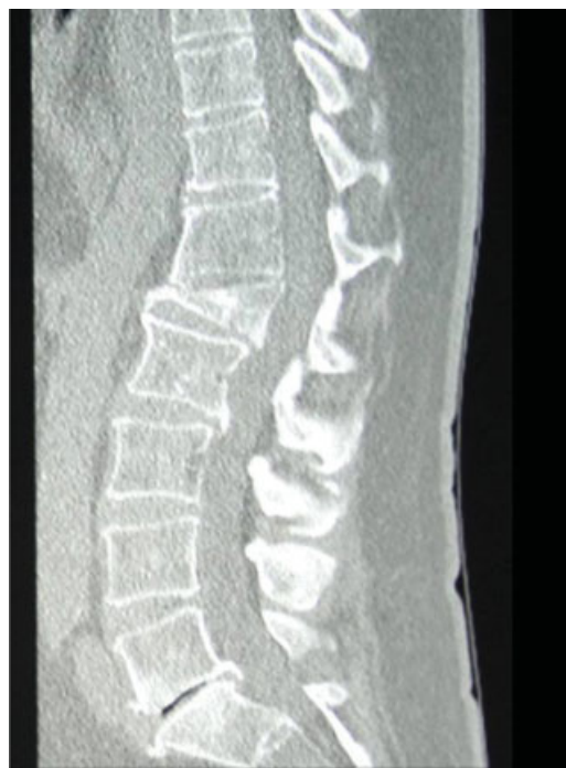
Fig. 1 Preoperative sagittal computed tomography (CT) reconstruction demonstrating L1 vertebral body fracture and kyphotic deformity of 15 degrees.

For the L1 corpectomy the patient was placed in the right lateral decubitus position and a 6-cm incision was made over the 11th rib directly above the L1 vertebral body. The rib was excised along the full extent of the incision, the parietal pleura entered, and blunt dissection performed below the diaphragm until the psoas muscle was clearly visualized. Serial dilators were passed through the psoas muscle approximately three quarters posteriorly on the L1–2 disc space using fluoroscopy and continuous electromyography (EMG) monitoring. The working retractor (MaxAccess, Nuvasive, San Diego, California, USA) was secured to the L1–2 disc space by a shim placed in the posterior blade. Following completion of the L1–2 discectomy, the retractor was turned slightly rostral and then opened fully to expose the T12–L1 disc space and