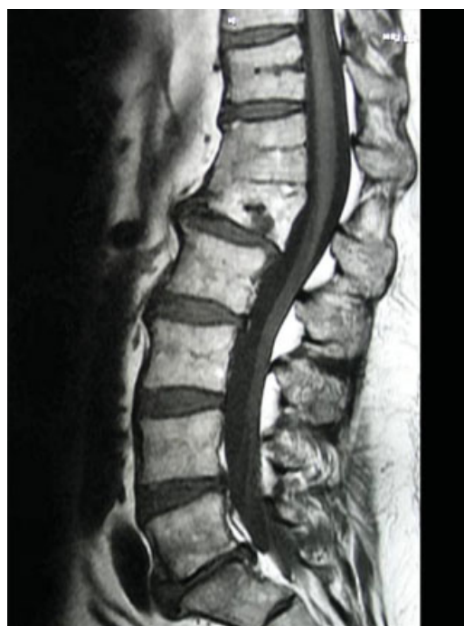
Fig. 2 Preoperative sagittal magnetic resonance imaging (MRI) demonstrating L1 vertebral body fracture, retrolisthesis, and anterior fusion mass.

the L1 vertebral body; the superior retractor blade was secured to the T12 vertebral body with another shim. Intraoperative somatosensory evoked potentials were monitored and the field was stimulated to ensure that lumbar nerve roots were clear of the field; the lumbar nerve roots were