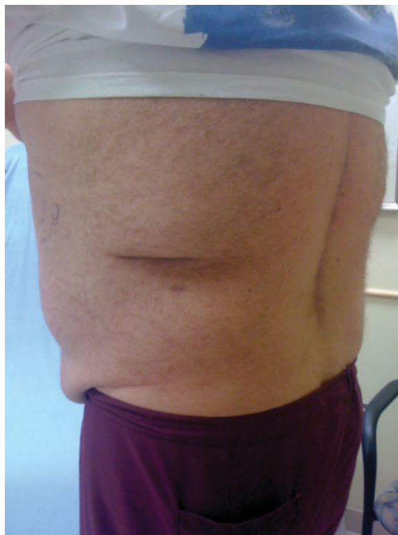
Fig. 4 Postoperative photograph of the patient's incisions. Note the small 6-cm incision used to access the anterior column.

Following the procedure, the patient did well and was discharged home on postoperative day 8. He reported decreased back pain and was able to return to work. One year following surgery, he rated his Visual Analog Scale (VAS) pain level as 3. Postoperative radiographs showed good placement of instrumentation and height restoration of the L1 vertebral body; the kyphosis angle was 2 degrees and the sagittal balance was normal (►Fig. 3). Additionally, his incisions healed well, and he was left with minimal scarring and without postthoracotomy pain (►Fig. 4).